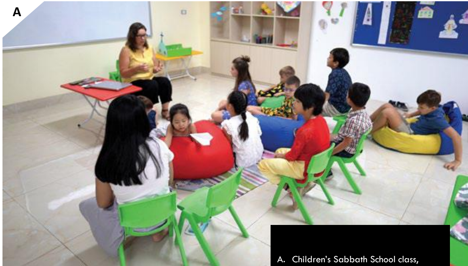
A. Children's Sabbath School class, Forward Venture, Hanoi, Vietnam B. A street view of Forward Venture, Hanoi, Vietnam